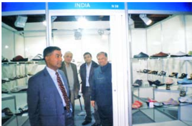
Visit of CGI & ED, CLE to the Stand of Stylo Shoes Pvt Ltd

On the whole, member participants have opined that the Council should continue to take part in this specialized footwear fair for mid, fine and luxury footwear. The Council could seek for either the same location or better location in centre of the Hall 7 to have prominence for CLE India Pavilion and thereby attract more number of business visitors. The next edition dates: Sept, 16-19, 2009