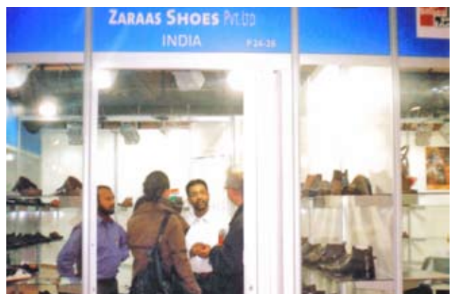
Visit of Buyers in stand of Zaraas Shoes Pvt Ltd