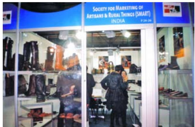
Visit of Buyers in Stand of SMART