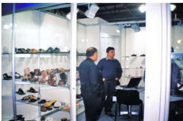
CGI and Other Officials discussing with the representative of Indian Leather Creation