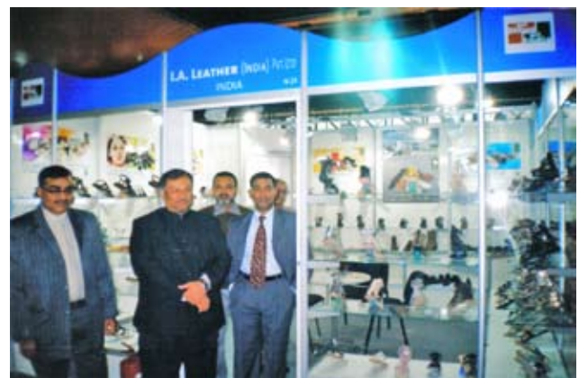
Visit of CGI with Director, DIPP and ED, CLE to the stand of I.A. Leather (India) Pvt Ltd

Participants were of the view that this shoe event is mainly promotes the quality and innovative products with greater specialization which are key factors for future success in